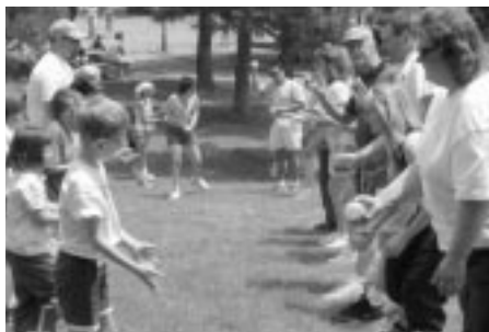
The water balloon line-up.

Children's Craniofacial Association celebrated a milestone June 22-25, 2000 with the tenth anniversary of Cher's Family Retreat. Consensus was that it was the best retreat ever! The fun, yet emotionally intense family retreat was held just outside Denver in Westminster, Colorado. Several families made trans-continental treks as thirty-five families from across the United States assembled to share support and a fun-filled week-