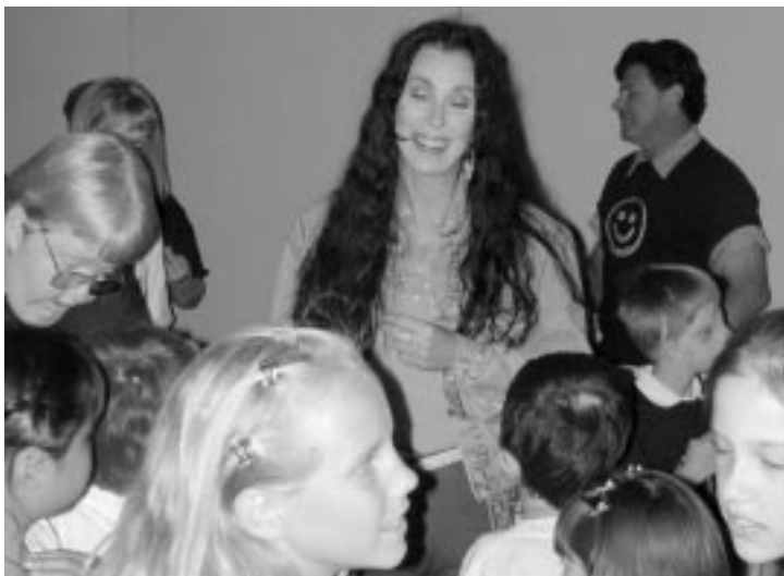
Cher rocks the night away with the kids.

the kids to "YMCA." After taking a breather, she took photos and chatted with each family. It was truly the highlight of the weekend! Her love, friendship and support are always so evident and she never lets us down. Thank you from everyone.