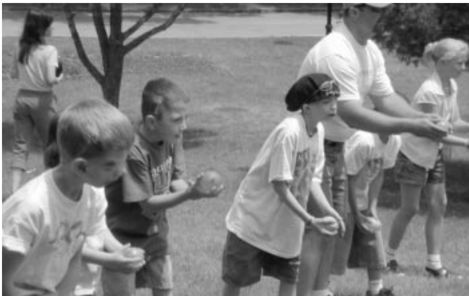
The water balloon toss was really heating up.

Cher's Family Retreat , cont'd from page 1 and Shainholtz battled to the finish in the hoola hoop contest! Congratulations to all of our champions!